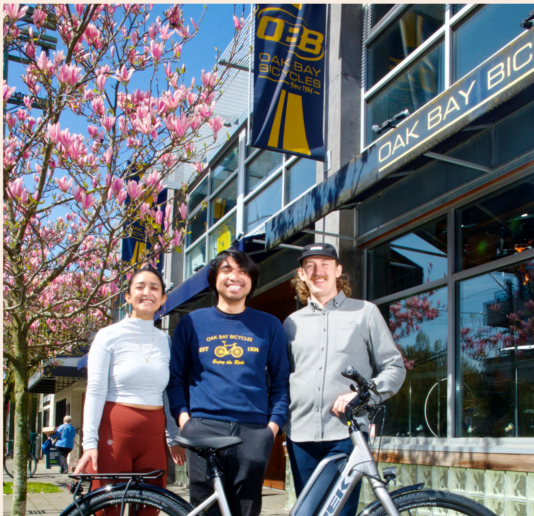
Photo of OBB staff with the Go By Bike Week 2022 Grand Prize.

Located on Oak Bay Avenue, this beloved bike shop has been supporting cycling for nearly a century. This local shop carries all the latest and greatest in many categories of bicycles including electric bikes!